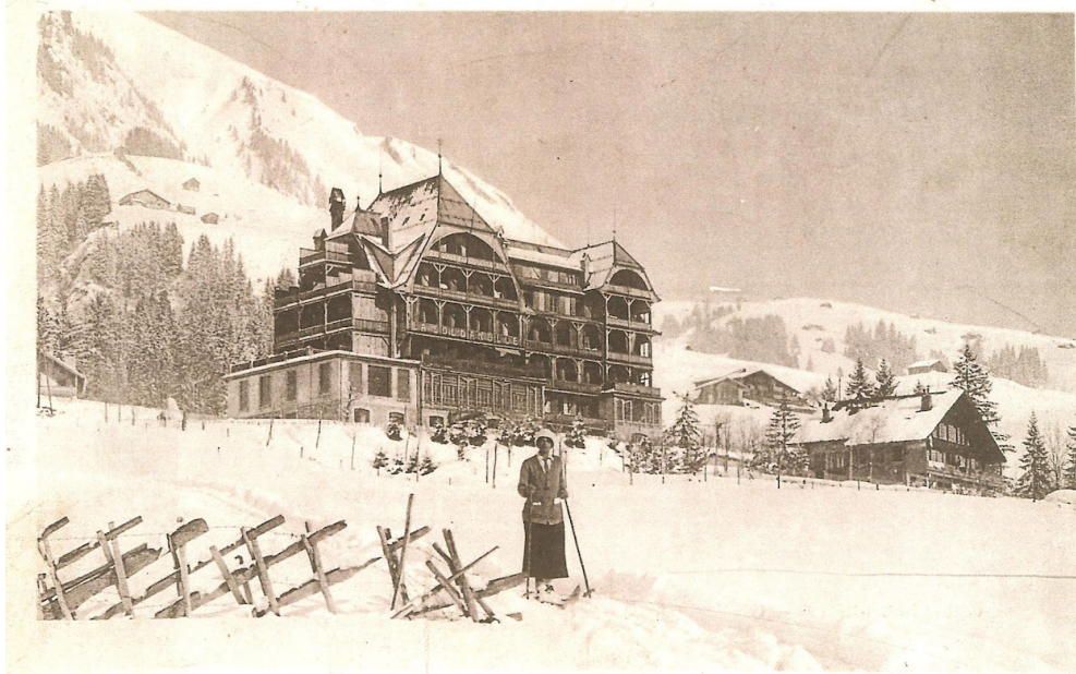
A. B. 156. Château-d'Œx. La Soldanelle.